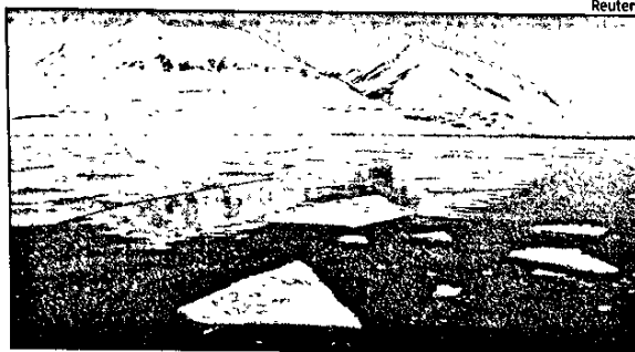
GOING, GOING, GONE?

Sea ice in the Arctic is disappearing at a far greater rate than previously expected, according to data from the first purpose-built satellite launched to study the thick-