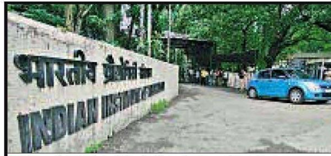
■ The online tests will be held on January 20.